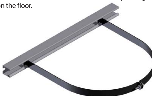
Figure 8 - Fixing Bracket (Strap Style)

Each strap is notched for insertion into the back channel allowing the container to be properly aligned. The bracket assembly is designed to be mounted to a rigid vertical surface with the container assembly resting fully on the floor.